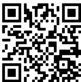
Enrollment inquiry form

Questions? Contact Central Office enrollment@ledyard.net